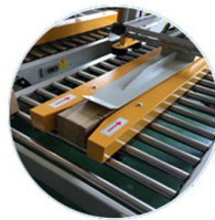
Custom-build for small Height of 50mm box