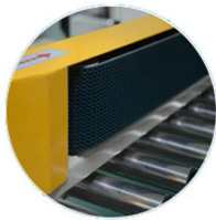
75mm wide side driven belt