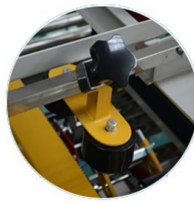
Keep box compact rollers