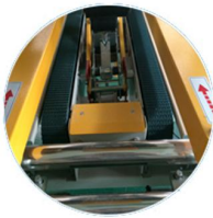
Top and bottom driven belt conveyor