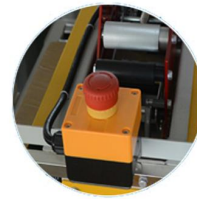
Safety emergency bottom